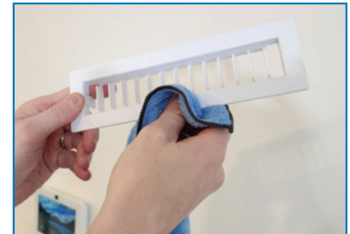
Clean the wall diffuser, and reinstall by aligning the snap-fit prongs with the boot, then push into place until it is in firm contact with the wall.