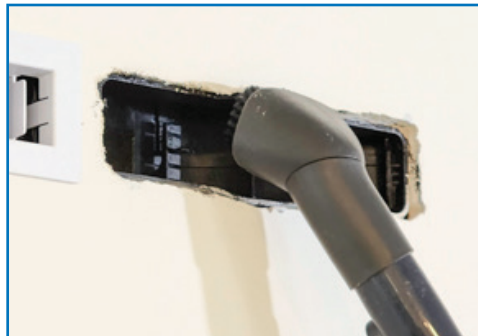
Using a vacuum and brush attachment, clean out any visible debris and dust. Take note of the damper strap position in the boot.