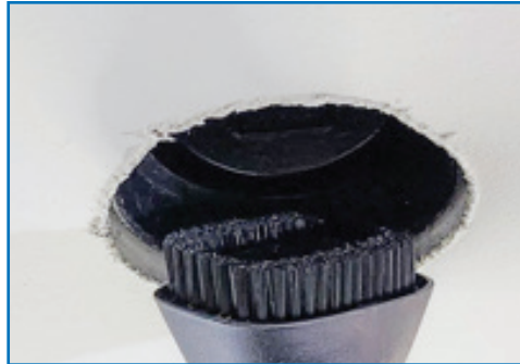
Using a vacuum and brush attachment, clean out any visible debris and dust in the boot. Take note of the damper position in the boot.