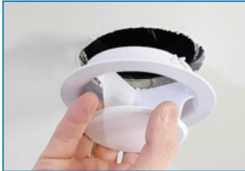
Remove the ceiling diffuser by twisting anti-clockwise until the diffuser is released. 3-inch diffuser is shown above, use the same method for the 5-inch diffuser.