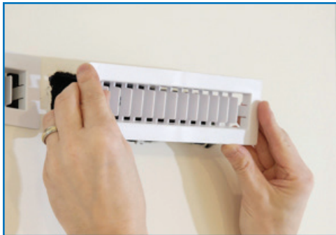
Remove the wall diffuser by pulling it firmly away from the wall.