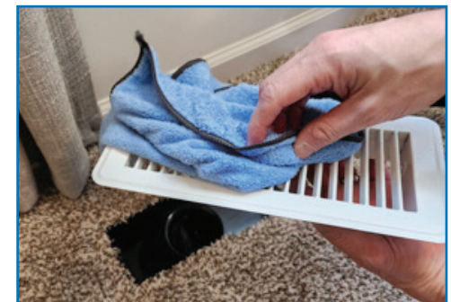
Clean the floor diffuser, and reinstall by dropping it into position, no fasteners are required.