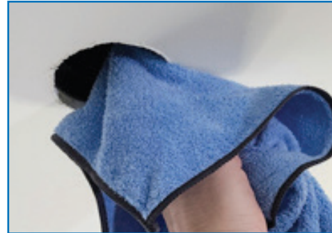
Wipe out the inside of the boot with a clean cloth. Make sure the damper in the boot is in the original position after cleaning.