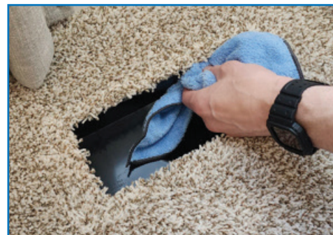
Wipe out the inside of the boot with a clean cloth. Make sure the damper in the boot is in the original position after cleaning.