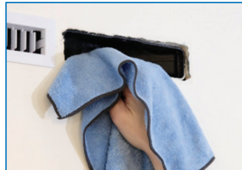
Wipe out the inside of the boot with a clean cloth. Make sure the damper in the boot is in the original position after cleaning.