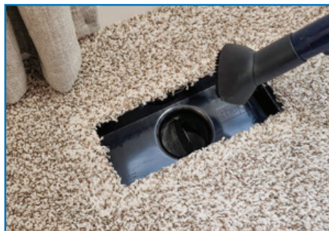
Using a vacuum and brush attachment, clean out any visible debris and dust. Take note of the damper position in the boot.