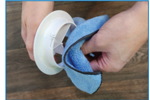
Clean the ceiling diffuser, and reinstall by aligning the prongs with the boot slots, twisting it clockwise until it is in firm contact with the ceiling.