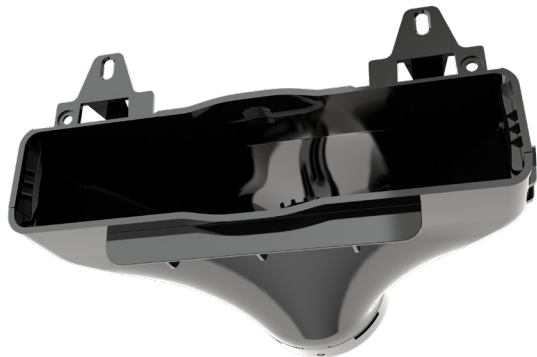
Pass Through Boot Assembly with Damper