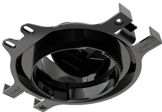
Ceiling Boot Assembly with Damper