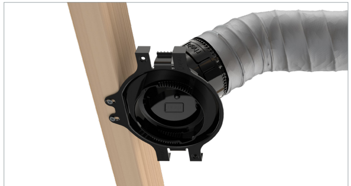
Ceiling Boot Assembly installed directly to framing