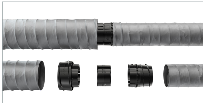
Coupler application to extend 3" to 4" duct run