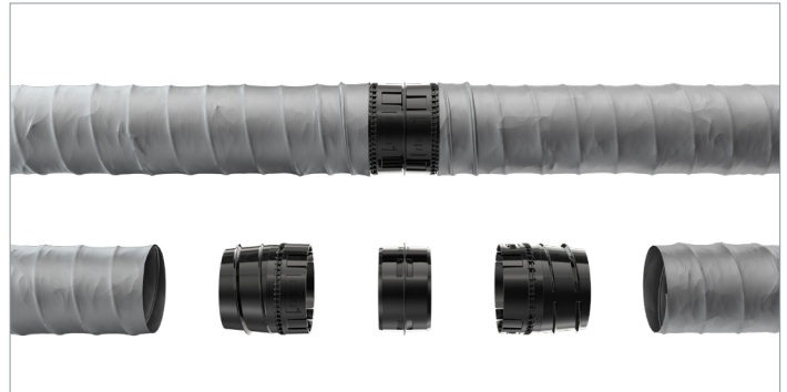
Coupler application to extend 3" duct run

For warranty information go to www.rheiacomfort.com/contact .