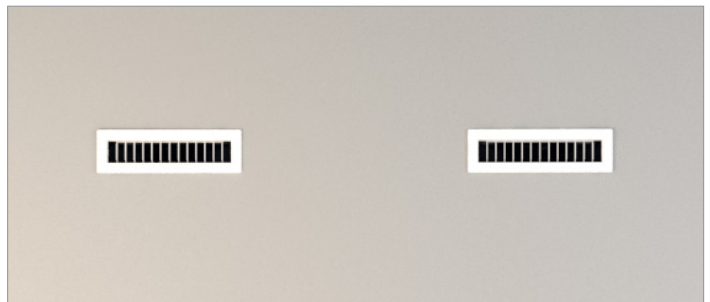
Slotted Diffusers installed in side-by-side configuration